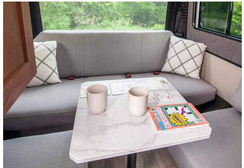
Rear lounge and seating area offers a great place to relax, work or dine.