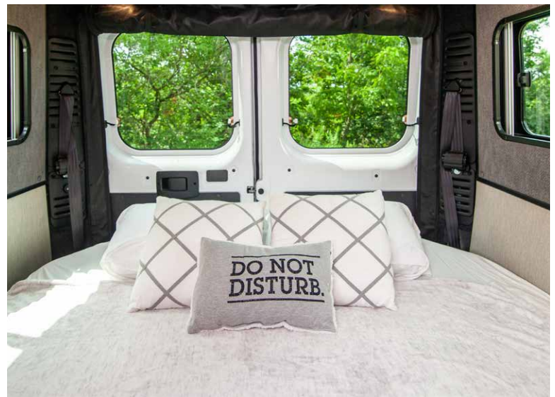
Rear power sofa easily transforms into a sleeping area with a comfortable queen size bed.