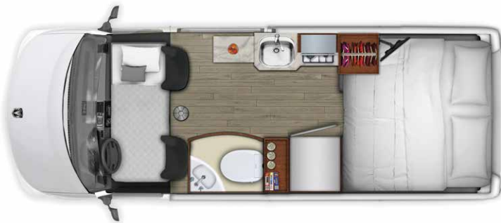
Interior floorplan evening with queen bed set up. (Shown with optional folding mattress.)