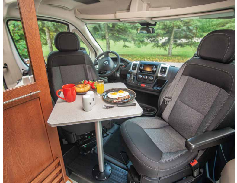
Front dining or work area comfortably seats two.