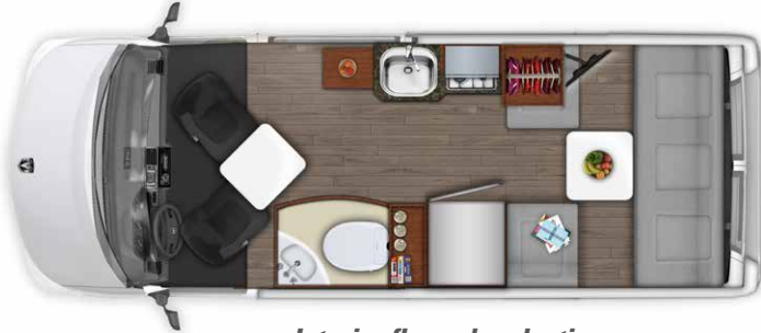
Interior floor plan daytime.