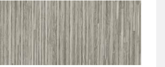
Cabinets - Silver Springs