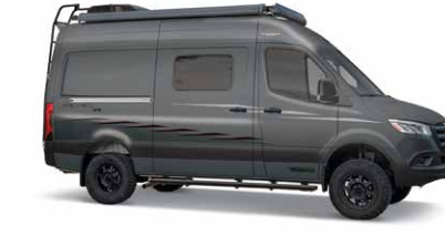
SELENITE WITH GRAPHICS