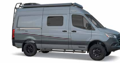
BLUE GREY WITH GRAPHICS