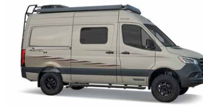
PEBBLE GREY WITH GRAPHICS