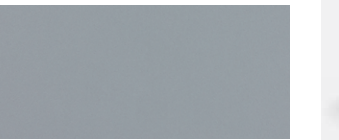
Cabinets - Pewter