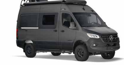
SELENITE WITH RAPTOR®