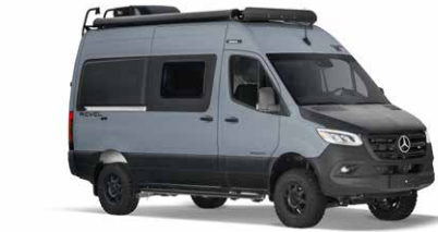
BLUE GREY WITH RAPTOR®