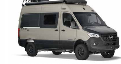
PEBBLE GREY WITH RAPTOR®