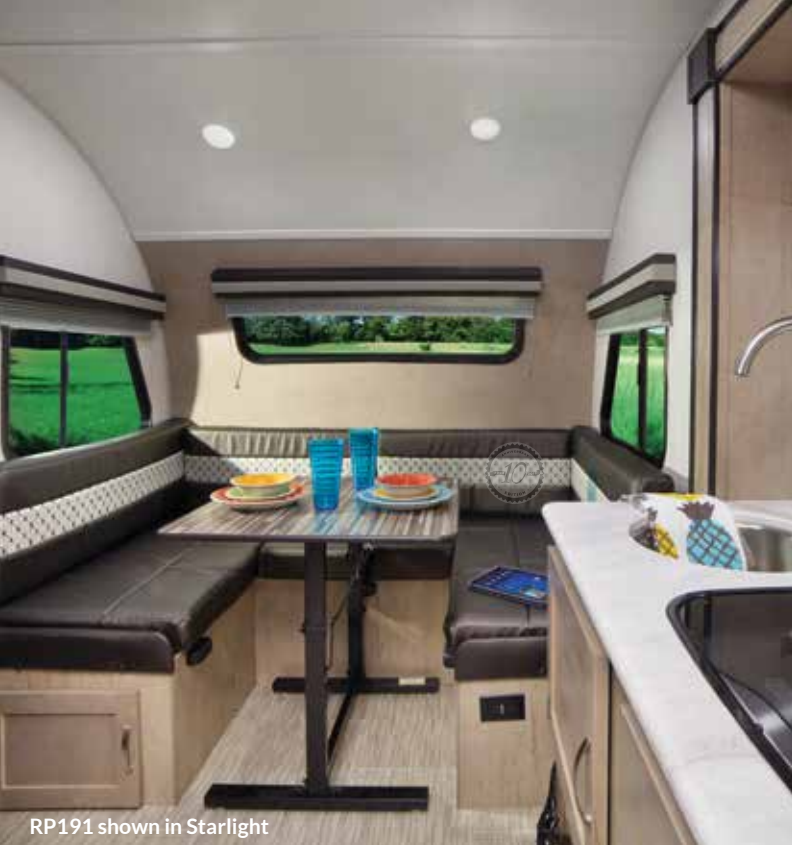
RP191 shown in Starlight