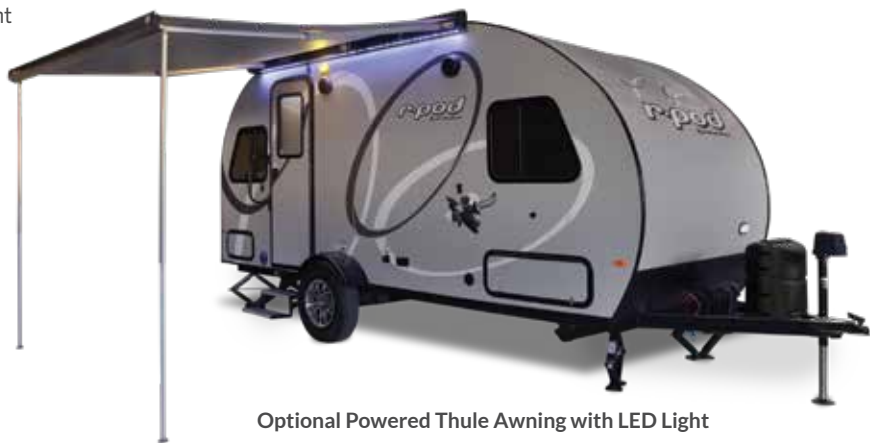
Optional Powered Thule Awning with LED Light

R•pod is celebrating it's 10th anniversary and we want you to be a part of the adventure. Sure, r•pod is affordable and has the lowest tow weight in its class, but you'll also love it's unique shape and construction. This fun pod comes standard with a 3.7 cu. ft. 3-way refrigerator to hold enough for those extended adventures. The interior has residential cabinetry, hardwood drawers and expandable cargo netting to stow movies or games when the elements keep you inside. After a fun-filled day of exploring, enjoy the convenience of the optional, removable outdoor kitchen under the LED lighted awning.