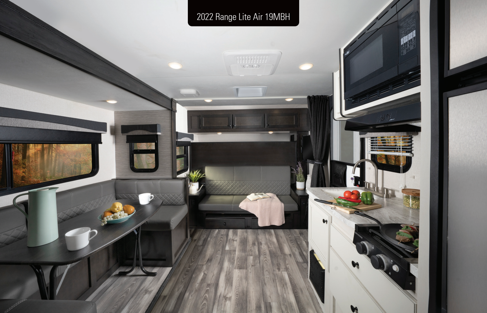
2022 Range Lite Air 19MBH