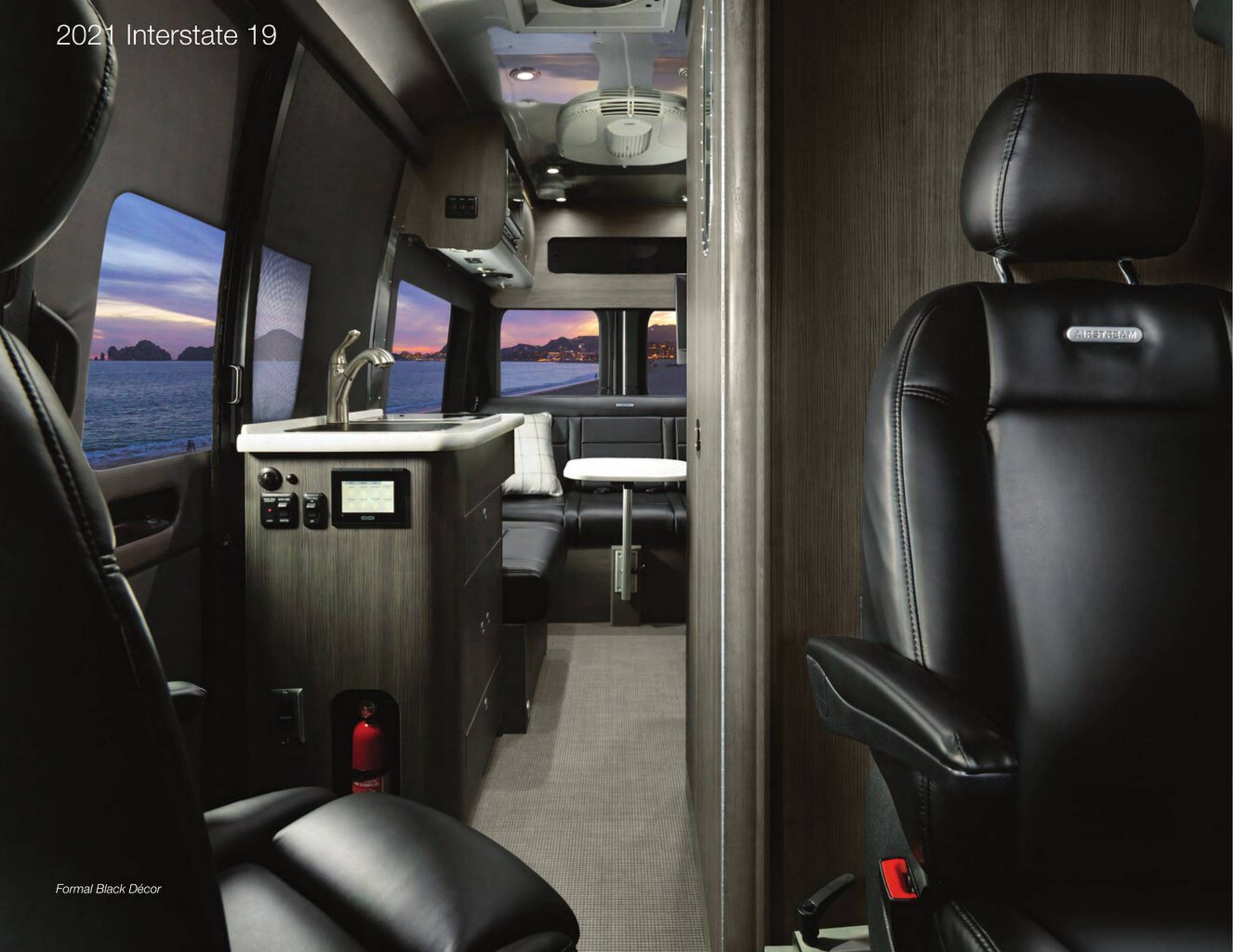
Formal Black Décor