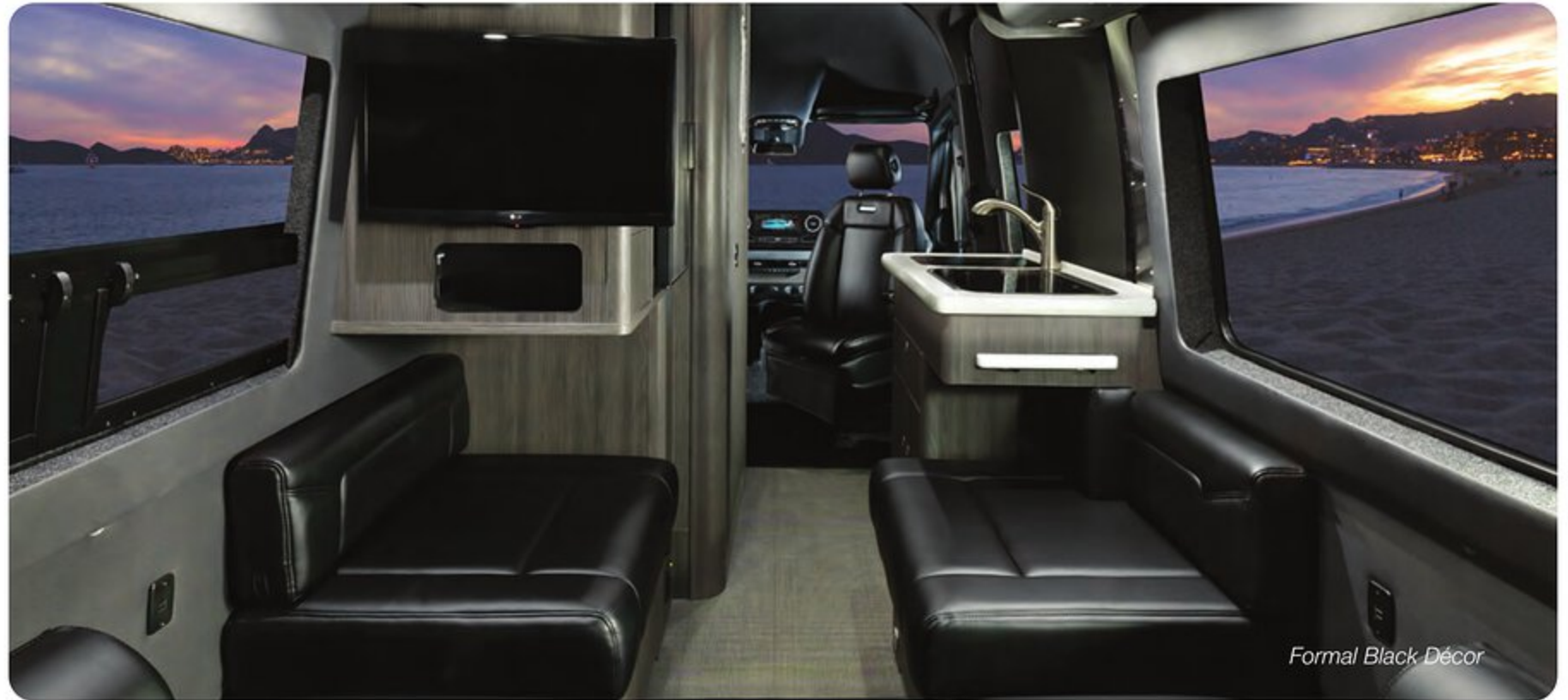
Formal Black Décor